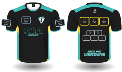
NWL training tops. Gold sponsor top position on back.