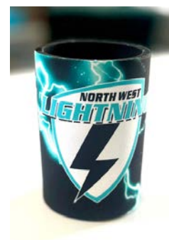
NWL stubby holder. Option to pay $500 for 1 of 2 positions on back of stubby holder.