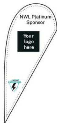
Tear drop banner. Image for illustrative purposes, design to change.