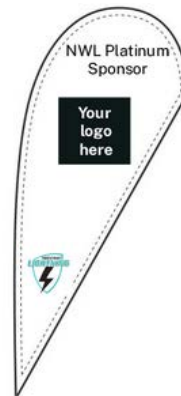
Tear drop banner. Image for illustrative purposes, design to change.