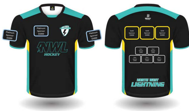
NWL training tops. Platinum sponsor on chest and sleeves.

YOUR LOGO ON THE NWL WEBSITE WITH LIVE LINKS TO CHOSEN PLATFORM (SOCIAL OR WEBSITE)